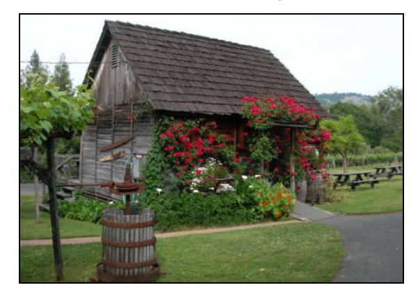
The Husch tasting room, originally a pony barn, reflects the farming focus of the winery. Wine lovers from near and far have visited Husch over the years and enjoyed our warm hospitality.

prescient decision when he decided to convert the estate property to no-till practices. Rather than rip the vineyard soils with a disc (a type of plow) we let the native grasses return to the vineyard. In the decades since that radical change, the vineyard has been sequestering carbon, harboring friendly insects, increasing rainwater infiltration, and building a new biological diversity that hadn't been seen on the land in 100 years. This initial step has led to other "light touch" practices such as banning harmful chemicals, returning to the 2000 year old approach of using sulfur dust for mildew control, and fossil fuel reduction. Responding to California droughts, we have pioneered new techniques to reduce vineyard irrigation by 90% in the past 25 years.